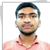
Suraj JEE (Main)