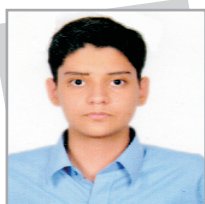
Govinda JEE (Main)