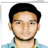
Sanskar IPU (B. Tech.)